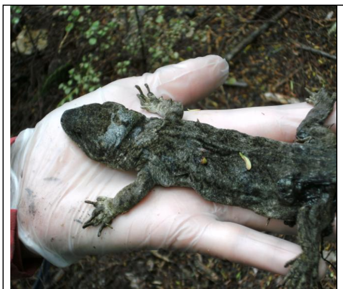
The trapped Duvaucels gecko sent to Te Papa

In January, a very rare Duvaucels gecko was found (unfortunately dead) in a rat trap. This confirmed that Duvaucels are still present on Great Barrier with the only other confirmed sighting being in 1970, some 40 years ago. Comprehensive follow up monitoring for a live specimen using G-Minnow traps was not successful but did show some of the range of lizard species present – shore skink, ornate skink, the uncommon striped skink, moko skinks, common skinks, and the common gecko. Both adult and juveniles of most species were represented indicating successful breeding.