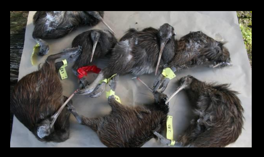
Part of the MBIE funded Kiwi Rescue programme August 2019