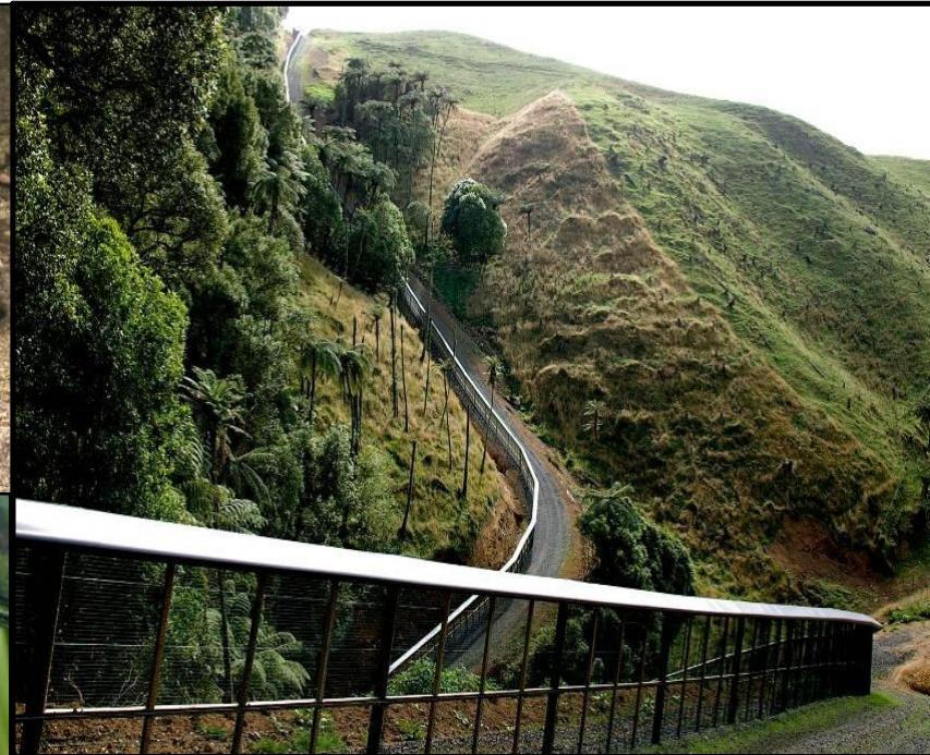
Pest-proof fence at Maungatautari, Waikato